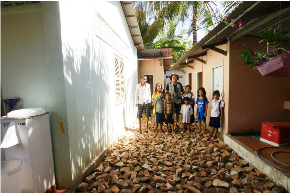
Cambodia Orphanage, installing rock for the foundation for the new patio floor.

Overnight we learned of the monster super typhoon nearing the Philippines. Looking at the satellite and seeing that this largest Typhoon in human history stretched from east of the Philippines to Cambodia in the west and from far south Vietnam to China in the north. The weather men had no idea where it would go at that point but rain was flooding everywhere across the region.