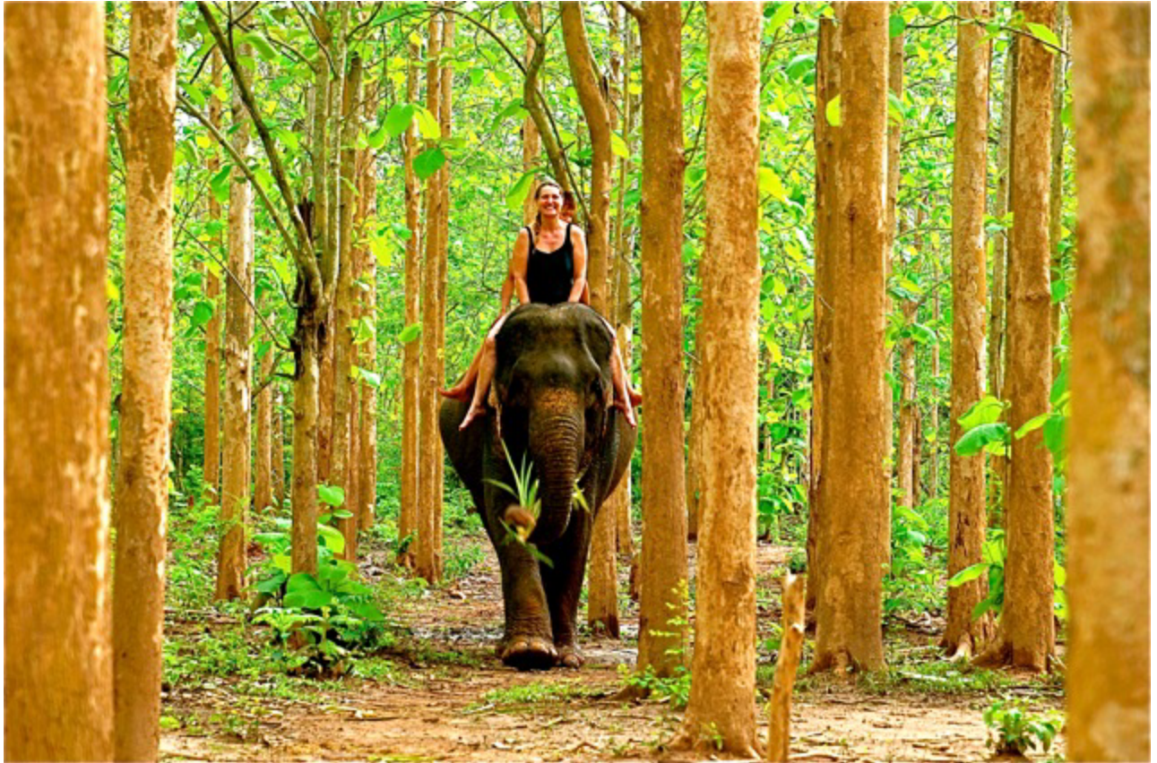
Fifth place Country of Laos Photo Contest