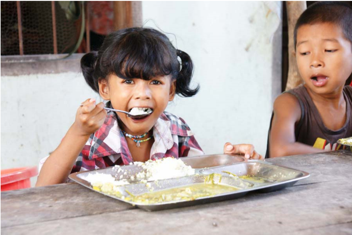
Cambodia Orphanage food delivery.

After hearing that there had been some exceptionally intense Monsoon rains this year and there was quiet extensive countrywide flooding, how it would affect the orphanage property which is just above the high water mark was needed to be addressed. When arriving at the orphanage that first evening it was dark and depressing and the lights were turned off for fear of electrocuting the orphans who were standing in ankle deep water. Only candles for illumination made it seem very depressing, dark and even dangerous for the children, certainly uncomfortable.