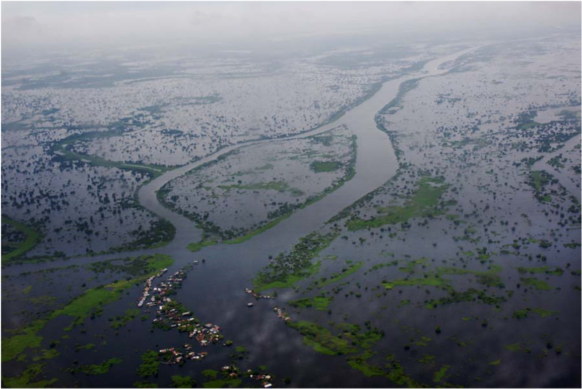
Cambodia season long flooding affecting the orphanage.

Urgent flood repairs needed at the Cambodian Orphanage now that the flood waters are beginning to subside, we will be doing repairs, more concrete work and flooring improvements also a new roof at the orphanage this March, 2014.