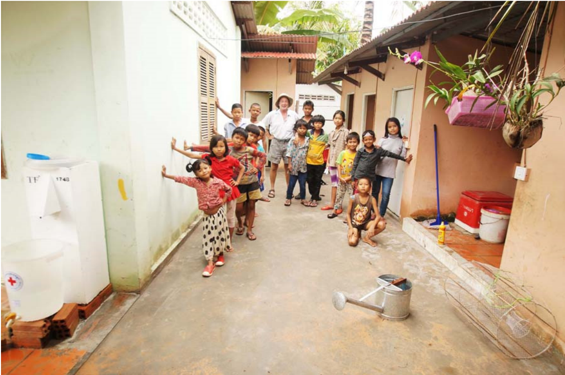
Cambodia Orphanage, the finished slab for the showers and toilets.

As it turned out the big Typhoon did not hit Cambodia but was followed by a monster tropical depression that dropped tons of rain on the already flooded country.