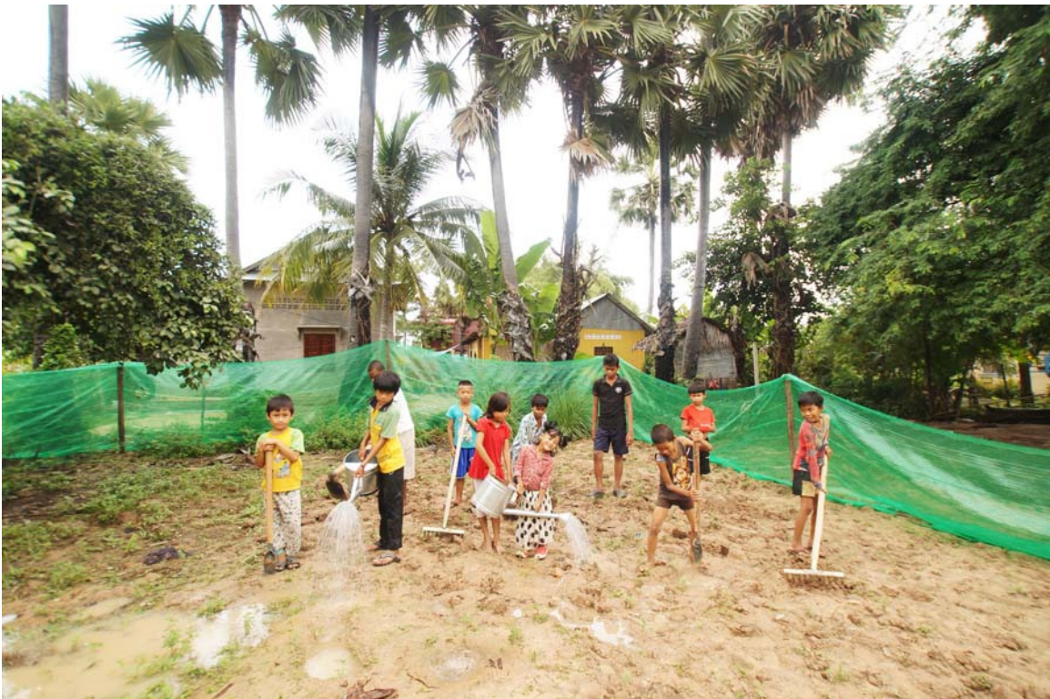
Cambodia Orphanage, working the earth for the new garden. We purchased the green fencing, seeds and the watering cans.

As it turned out the big Typhoon did not hit Cambodia but was followed by a monster tropical depression that dropped tons of rain on the already flooded country.