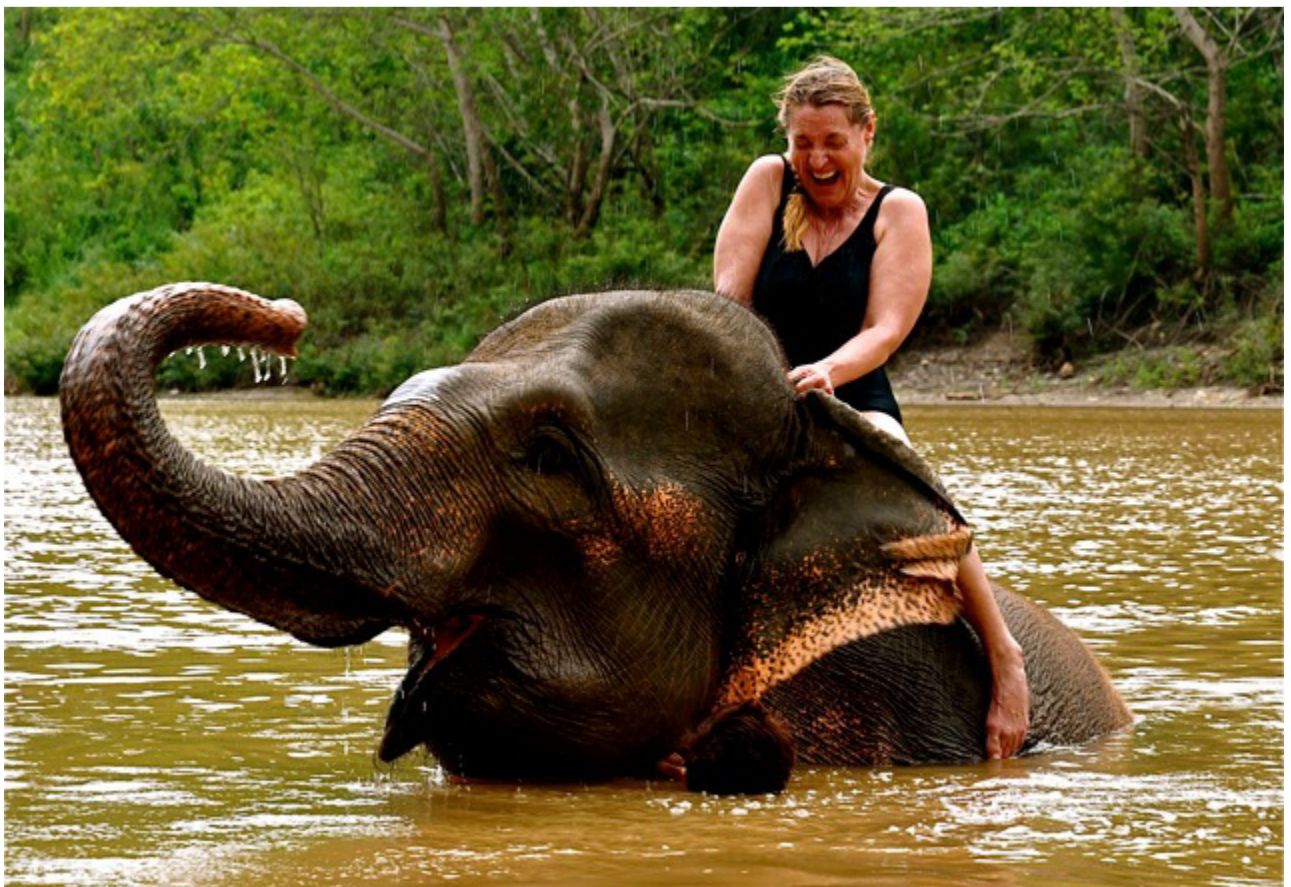
This photo also won an award in the Best of the Country of Laos photo contest.