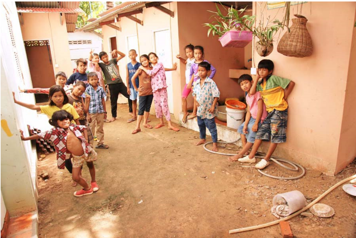
Cambodian Orphanage, the original Sand lot floor for shower and toilet rooms.

Overnight we learned of the monster super typhoon nearing the Philippines. Looking at the satellite and seeing that this largest Typhoon in human history stretched from east of the Philippines to Cambodia in the west and from far south Vietnam to China in the north. The weather men had no idea where it would go at that point but rain was flooding everywhere across the region.