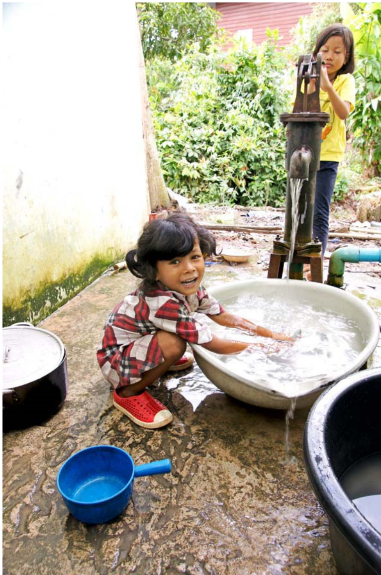
Orphanage Cambodia, we poured a new slab for the clothing and dish washing water pump room.

In the meantime, we with the orphans, built a garden and garden fencing for some locally grown vegetables and healthy activities for the children.