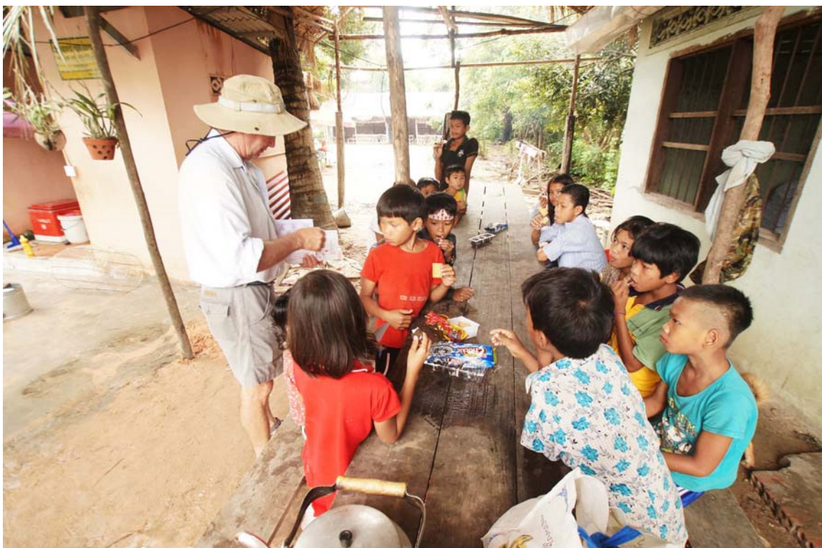
Orphans Cambodia, taking a break at the end of the 4 days hard work with cookies and drinks.

In the meantime, we with the orphans, built a garden and garden fencing for some locally grown vegetables and healthy activities for the children.